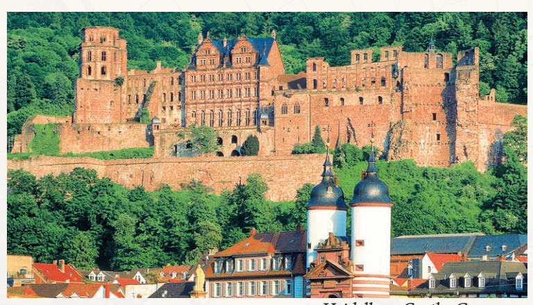
Heidelberg Castle, Germany

This extraordinary 11-day "Grand Tour" of Europe features an incredible combination of river, rail, lake and mountain travel including five nights aboard the deluxe AMADEUS SILVER III. Journey through the western heart of the Continent through Switzerland, France, Germany and the Netherlands, cruising the fabled Rhine River. Specially arranged guided excursions feature five great UNESCO World Heritage sites—see the Jungfrau-Aletsch region of the Swiss Alps, walk through Berne's Old Town, tour the Alsatian city of Strasbourg, cruise through the Rhine River Valley, and see Cologne's Gothic cathedral. Also visit Germany's medieval Rüdesheim and 13th-century Heidelberg Castle. Spend two nights each in Lucerne and Zermatt, Switzerland; ride aboard three legendary railways—the Pilatus Railway; the world's steepest cogwheel railway, the Gornergrat Bahn for breathtaking views of the Matterhorn, and the Glacier Express from Andermatt to Zermatt—and enjoy a scenic cruise on Lake Lucerne. This is the trip of a lifetime at an exceptional value! Complement your journey with the two-night Amsterdam Post-Program Option.