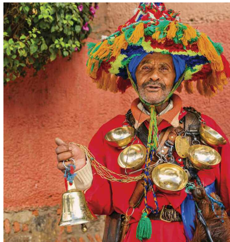
Water seller in Marrakech

Moroccan Culture. Learn how a blend of Arab, European and African influences, religions and traditions created Morocco's captivating culture.