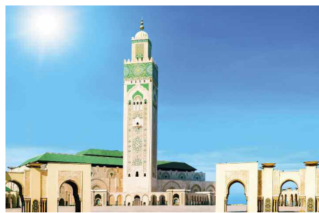
Hassan II Mosque, Casablanca