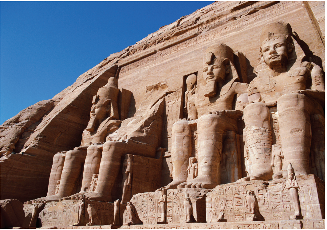
The magnificent temples at Abu Simbel commemorate Ramses II and his queen, Nefertari.

of the Aswan High Dam. Next we visit the imposing temple to Isis on Agilkia Island before boarding our Nile cruise ship. This afternoon we embark small feluccas , replicas of ancient Nile sailboats, for a relaxing sail. Back on board our ship tonight we enjoy the Captain's welcome cocktail party. B,L,D