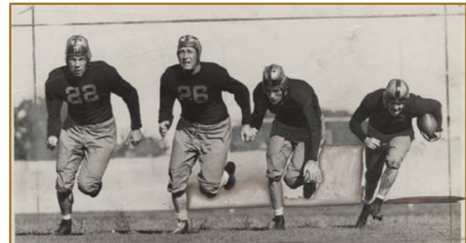
The Boilermaker Backs, 1935