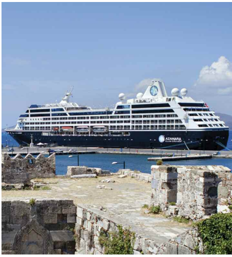
Sister Ship Azamara Quest